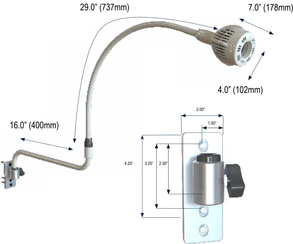
Mounting Holes fit for Exam Table / Procedure Chair Brackets