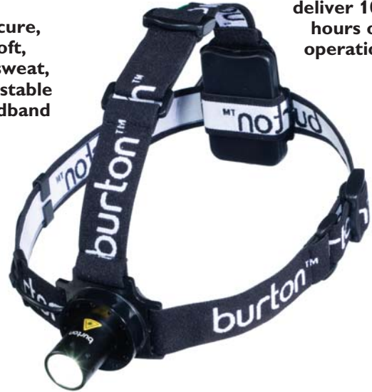
1.25 watt LED

Three AAA batteries deliver 100+ hours of operation